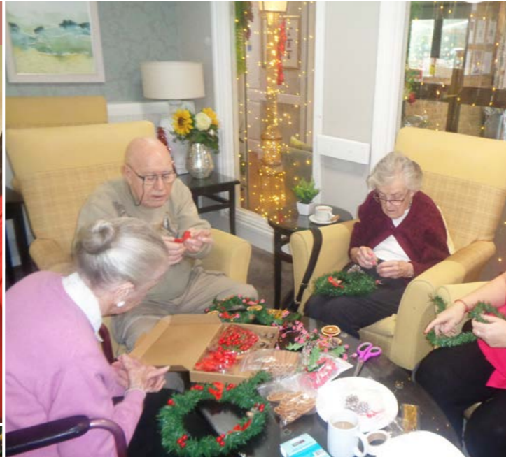
Wreath-making for bedroom doors