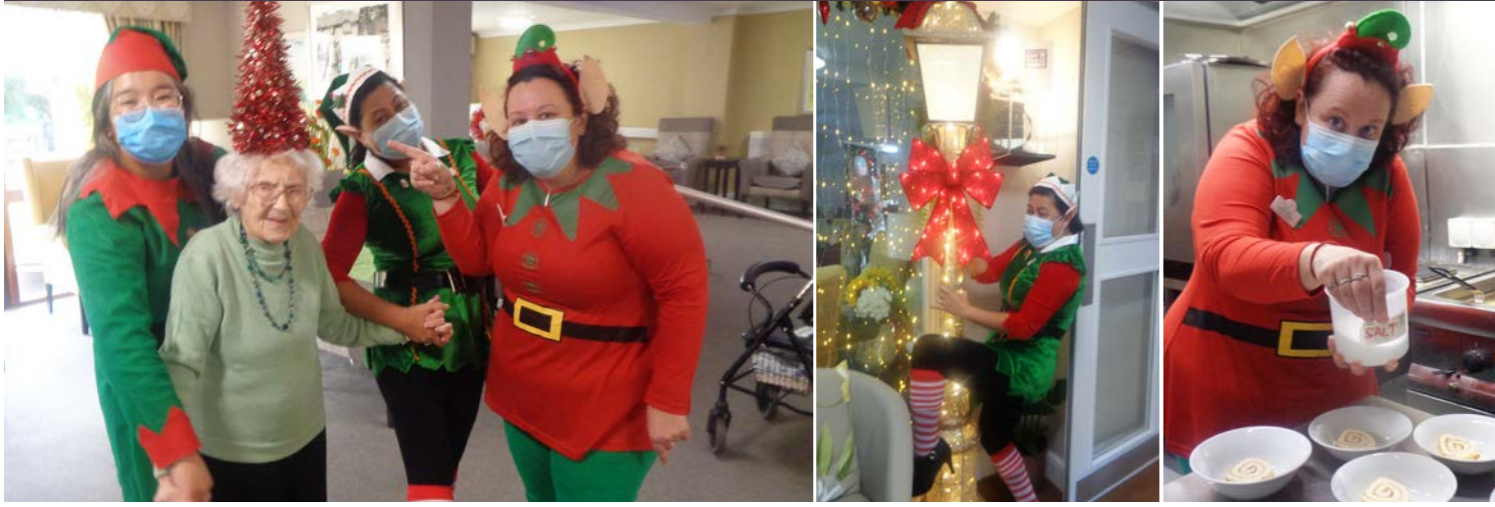
Elves causing havoc on Elf Day!