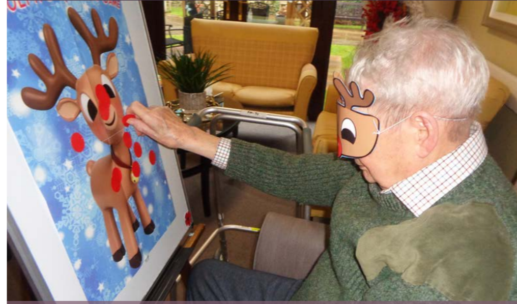
Christmas Day games!