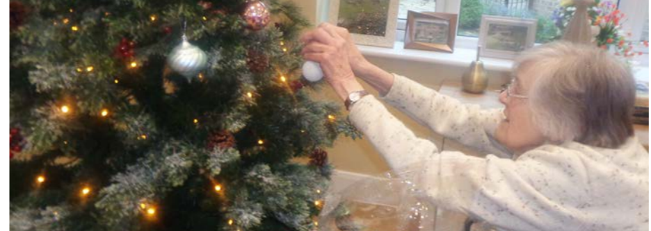
Decorating our Christmas tree during a one-to-one