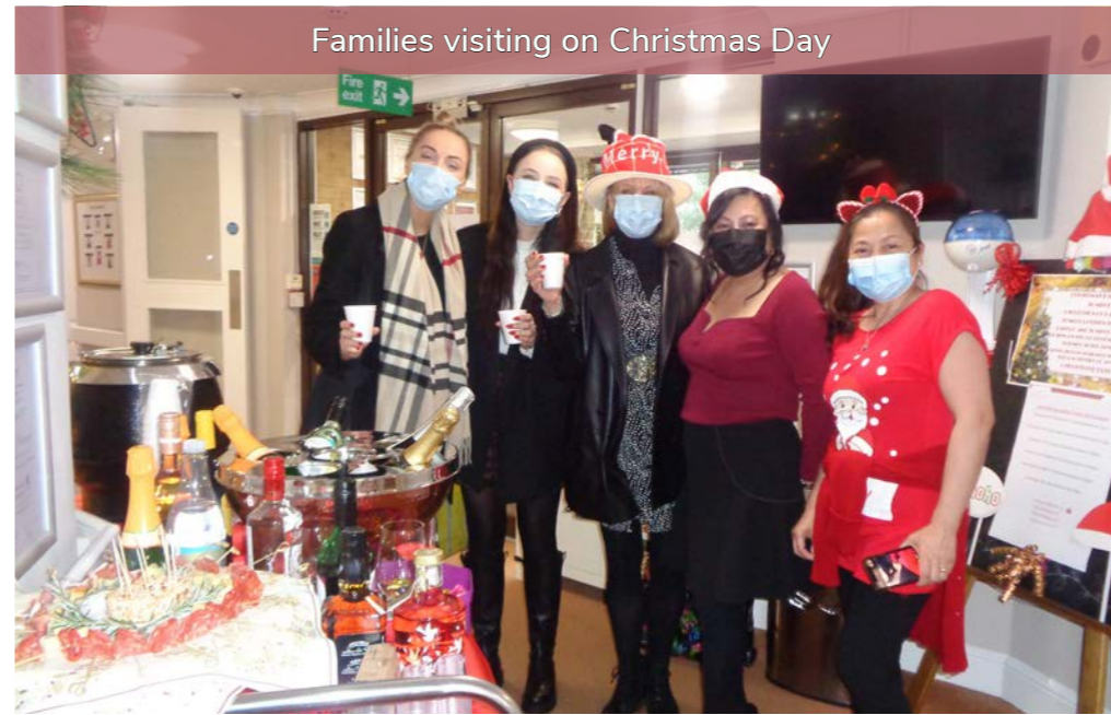
Families visiting on Christmas Day