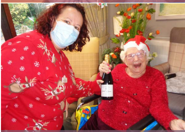
Residents loved their Festive Fun Day with a tombola, photoshoot and pantomime