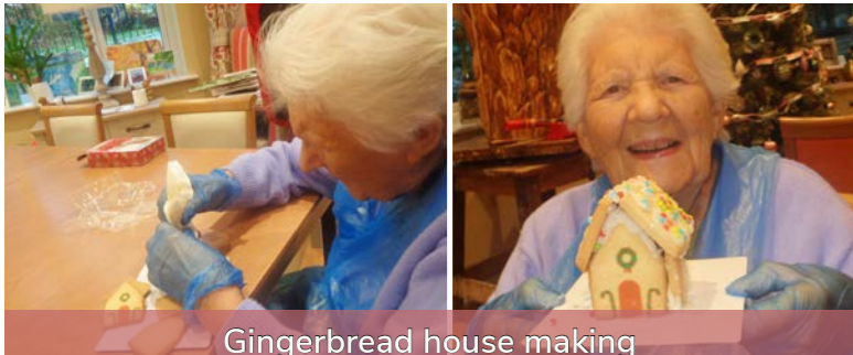
Gingerbread house making