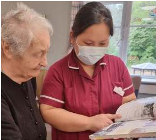
Story telling and sing-a-longs