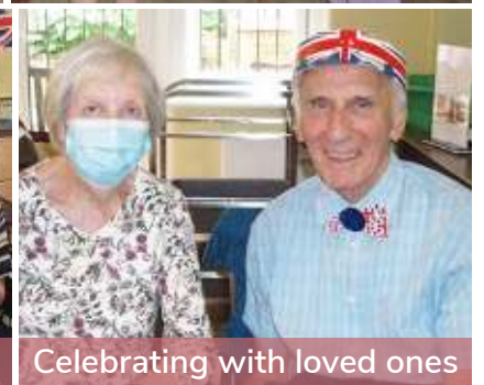
Celebrating with loved ones