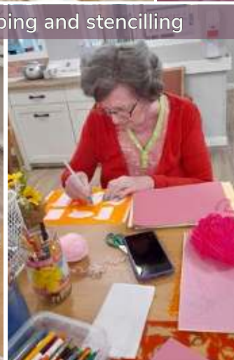
Painting, ink stamping and stencilling