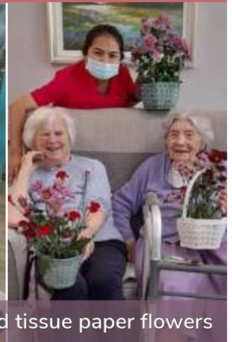
Flower arranging and tissue paper flowers