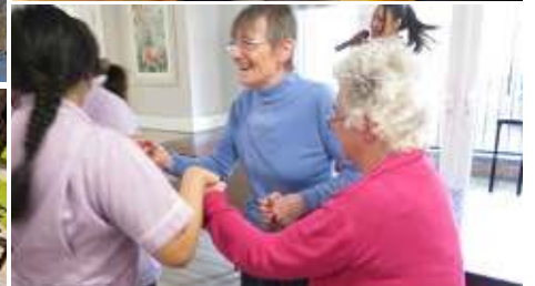
Musical exercise and dancing!