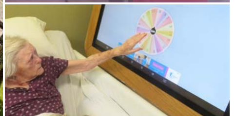
Activity table and chair yoga