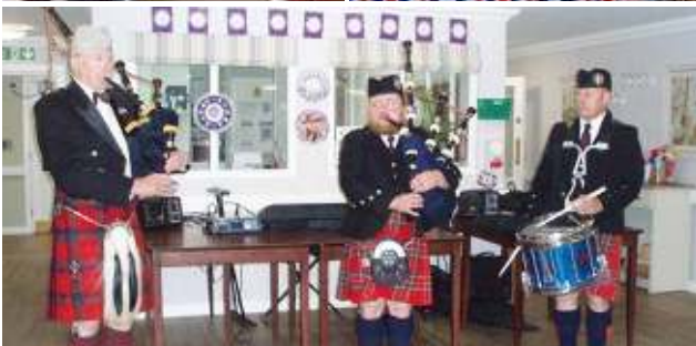
Prop filled photo shoot!