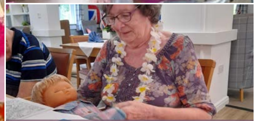
Flower Day to celebrate the Chelsea Flower Show!