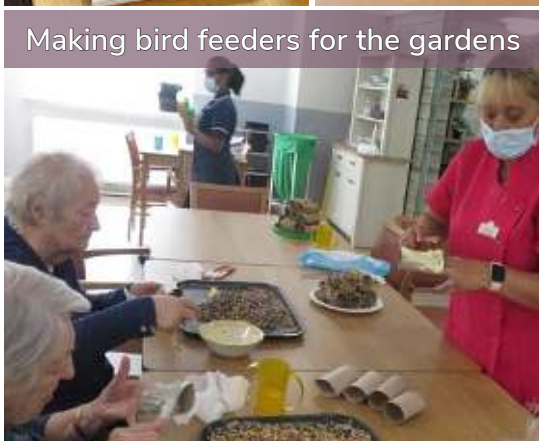
Making bird feeders for the gardens