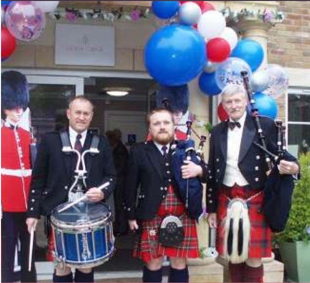
A wonderful performance from Scots Guards Association Pipes and Drums (South)