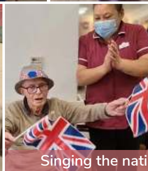
Singing the national anthem