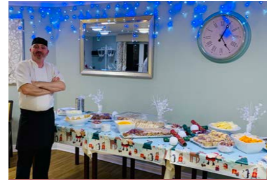
Delicious buffet at Rowan Lodge!