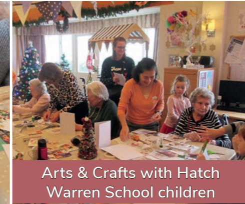
Arts & Crafts with Hatch Warren School children