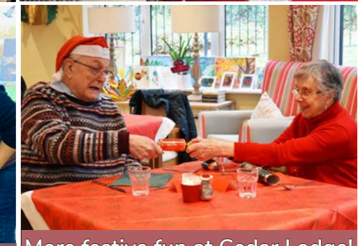
More festive fun at Cedar Lodge!