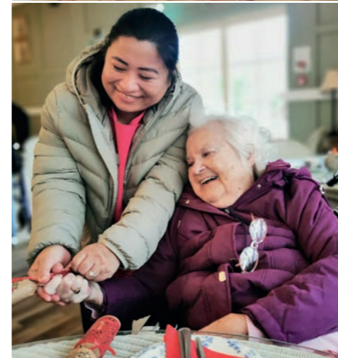
A special visit from the Rainbows, they sang carols and made beautiful Christmas cards for our residents