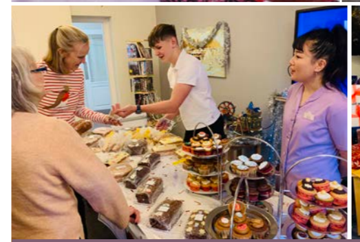
Cakes, chutneys, raffle and The Purple Ladies Choir at Oak Lodge