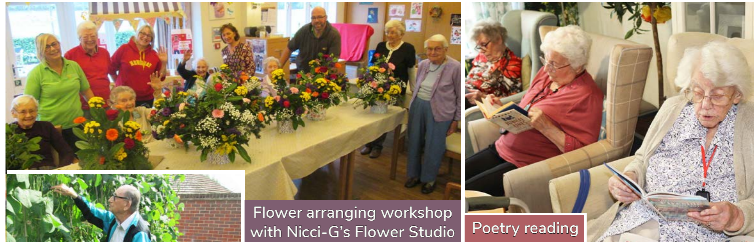
Flower arranging workshop with Nicci-G's Flower Studio