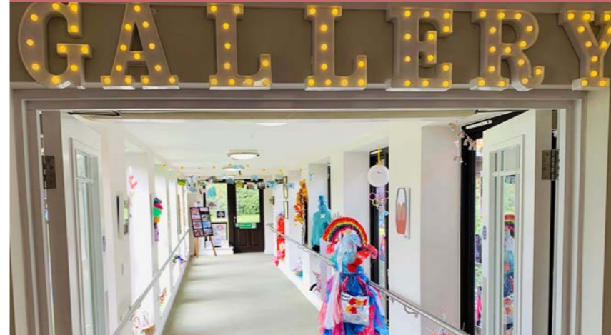
Residents & families across our homes came together to celebrate 'Arts in Care Homes'. The event theme 'reflections' spanned painting, crafts, photography, Irish & Indian dance, music, poetry, creative writing, and martial arts.