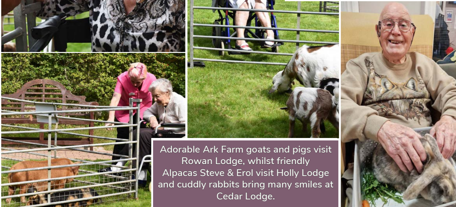
Adorable Ark Farm goats and pigs visit Rowan Lodge, whilst friendly Alpacas Steve & Erol visit Holly Lodge and cuddly rabbits bring many smiles at Cedar Lodge.