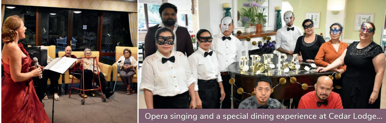
Opera singing and a special dining experience at Cedar Lodge...