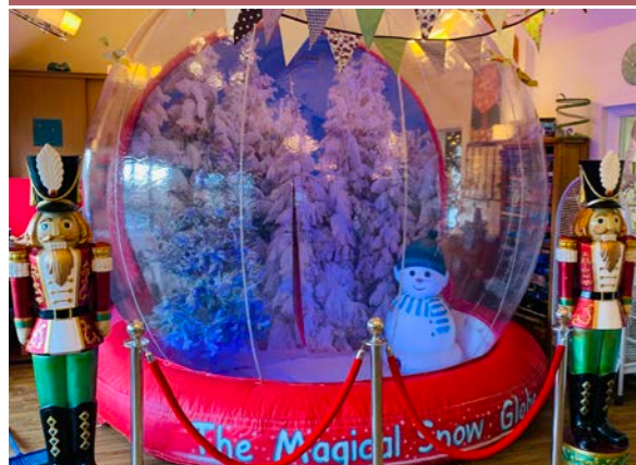
Lots of festive fun at Oak Lodge's Winter Fayre with mulled wine, Christmas cakes, handmade crafts, face painting, and a magical snow globe for everyone to enjoy!