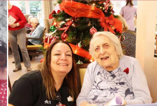
Winter Fayre at Holly Lodge!