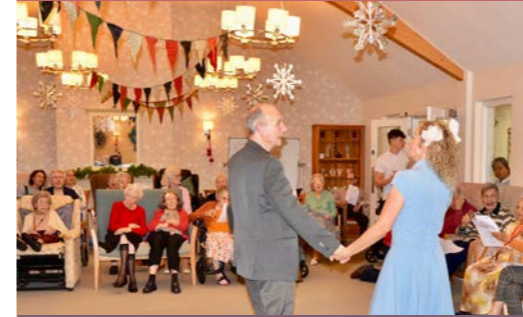
Surrey Jivers visit Oak Lodge