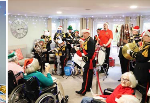
Rowan Lodge residents enjoy a spectacular performance from The Royal British Legion and a sing-a-long to the mandolin