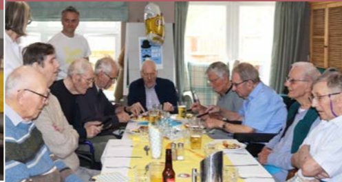
We celebrated International Men's Day with great food & beer!