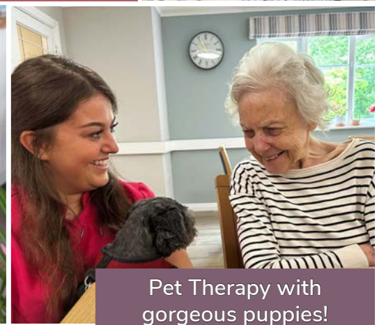
Pet Therapy with gorgeous puppies!