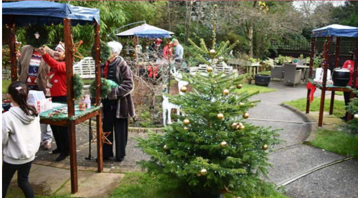
Christmas Market at Cedar Lodge with delicious treats, crafts, raffle and sausages on an open fire...