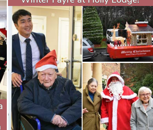
Santa visits Holly Lodge!