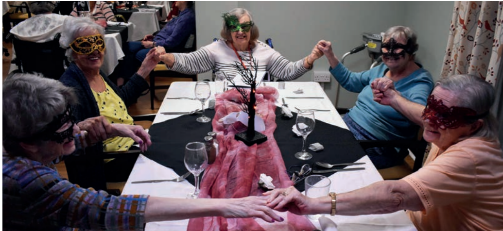
Phantom of the Opera comes to Rowan Lodge...