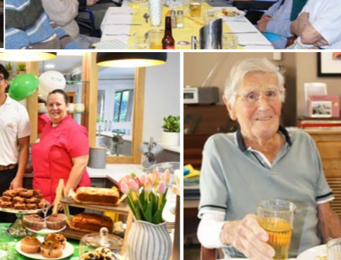
Cedar Lodge residents host a Cake & Coffee morning in aid of Macmillan